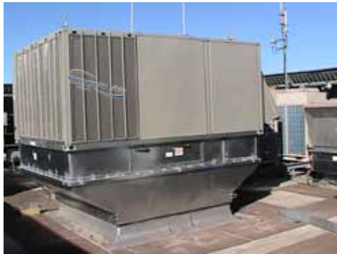
Norman OK Police Station

How many roof top units are you planning to replace in the near future?