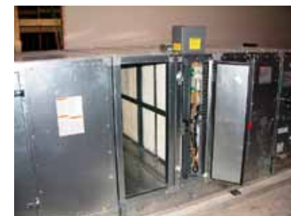
Bellevue Elementry Bellevue, Nebraska

Dugway Proving Grounds Western Desert Test Center (2006). WDTG-TR-06-078,3.8,33.