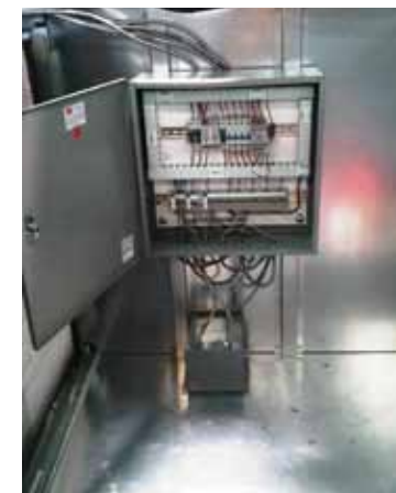
George Bush Presidential Library

Third Party Testing available thru your local Trane Accounts Manager