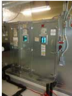
St Luke's Vintage Hospital Houston, Texas

What are the dollars for filters that are spent that primarily protect the HVAC equipment?