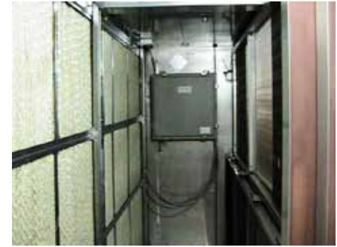
Norman OK Public Library

Based on research findings and on ASHRAE's position, it seems prudent for infection-control professionals and building designers to consider additional control measures for airborne transmission, in addition to the precautions already in use when designing new healthcare facilities and updating existing facilities. 4